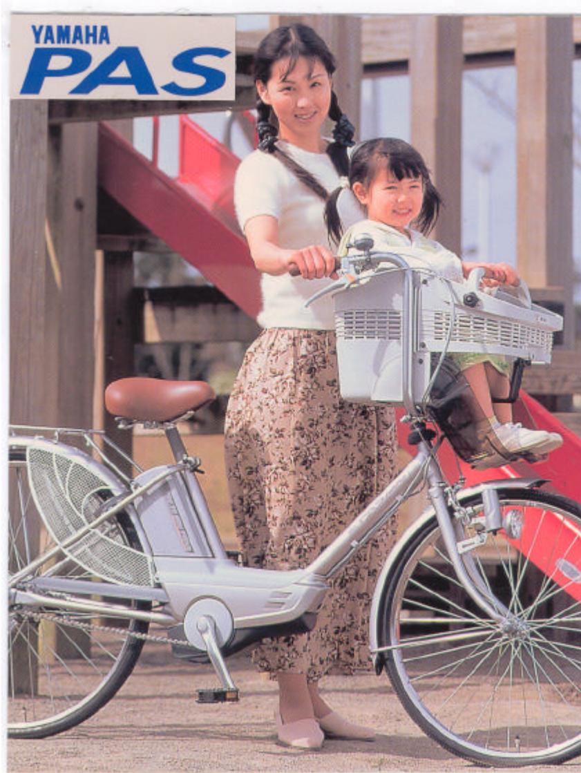
Figure 2. The PAS Little More has (1) a stable child seat, (2) ease of control and operation with a new keyless switch design and battery remaining indicator, (3) dynamo lighting control from handle bar mounted lever, (4) battery charging time of only 2.8 hours; on a single charge will travel 38 kms over flat roads. (5) It has a 3 speed integrated gear.