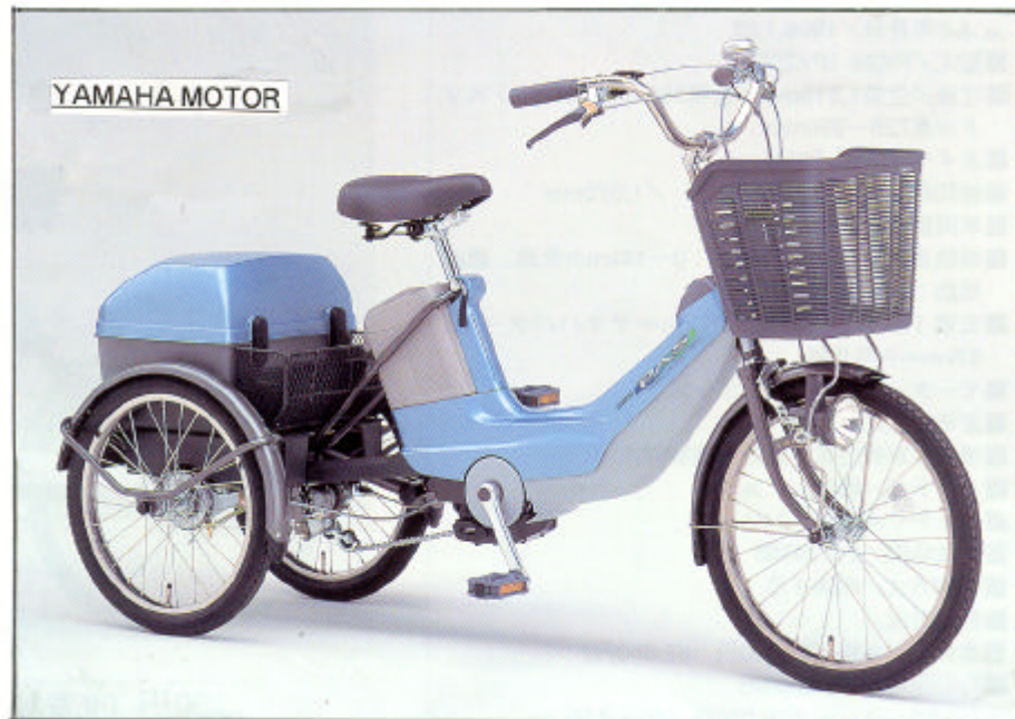
Figure 4 This Yamaha electric shopping tricycle has excellent stability and load carrying power. Battery charging takes 2.8 hours and it will carry the rider 35 km on flat roads. Electronic indicators show battery levels and a dynamo light is fitted that stays bright at low speeds. It comes complete with a built in front wheel lock, comfortable sprung saddle and front basket. Retail price in Japan A$3550

In 1990s the main problem for most E-PAB users was that they were too heavy for lifting up stairs into a typical Japanese home or into other vehicles. Even the small wheeled models weighed 24 to 27 kg and the large wheeled models weigh between 24 and 31 kg. The three wheeled shopping E-PABs were much heavier at 36 kg to 39 kg.(See photograph 3) The weight problem was particularly troublesome for the elderly so a lot of design effort is going into reducing the weight without increasing the price.